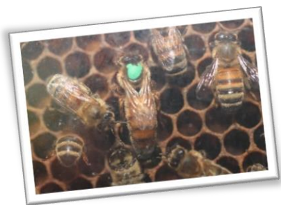
Honeybee queen laying eggs Sweet Betsy Farm Observation Hive 2015