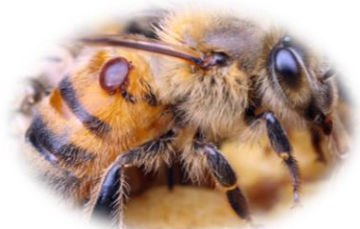
Adult Varroa mite on adult honeybee

Beekeepers tend to fall into one or two management styles and follow either use of chemical miticide treatments or chemical/treatment-free beekeeping. Whichever path you follow, a combination of management practices is often useful. If interested in any of the options listed here, educate yourself further with additional Internet and published reference research. But bee-forewarned: evidence-based advice is often difficult to distinguish from anecdotal-based advice; however, the wise beekeeper should only follow established evidenced-based opinions.